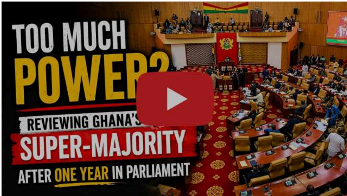
Too Much Power? Reviewing Ghana's Super-Majority After One Year in Parliament. - Episode 9