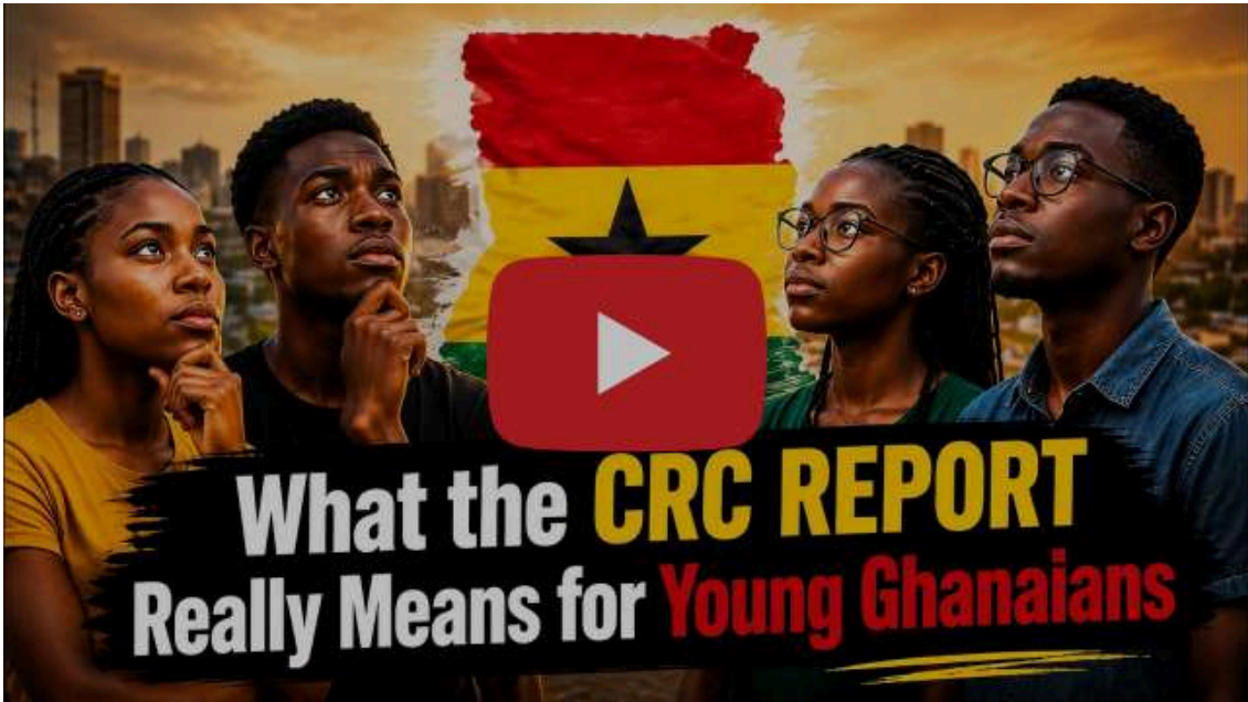
What the CRC Report Really Means for Young Ghanaians - Episode 11