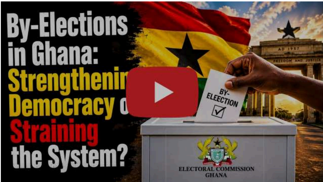
By-Elections in Ghana: Strengthening Democracy or Straining the System? - Episode 10